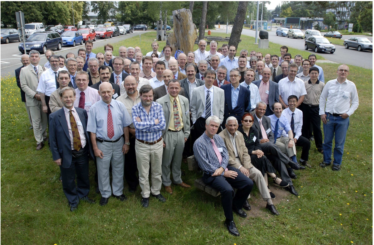
ERMSAR 2007 – Karlsruhe – June 12-14, 2007

ERMSAR 2008, September 23-25, 2008, Varna (Bulgaria).